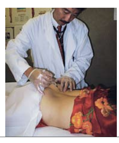
Treatment for left sacroiliac joint pain